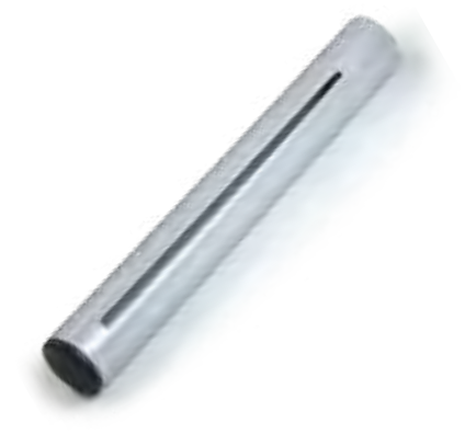
MKF ALR intake slot