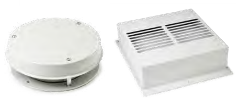
Supply air modules